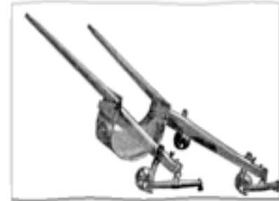
Horse or tractor drawn tree cutter