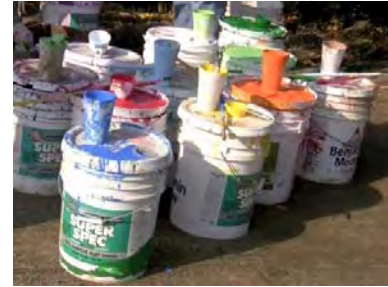
Use non-toxic colors to mark trees